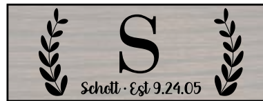
4) Serif Family Vines 24x10