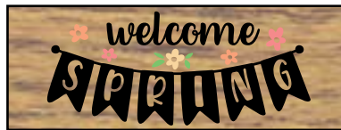
3) Welcome Spring 24x10

Workshop fee will help raise money for the high school yearbook program.