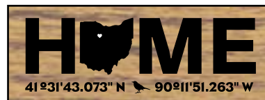
7) State Home Coordinates* 24x10 10x24