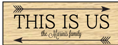
6) Family Arrows 24x10