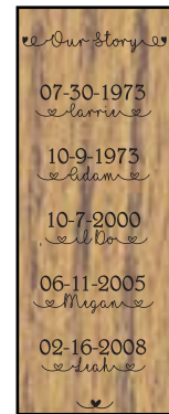
5) Our Story 10x24