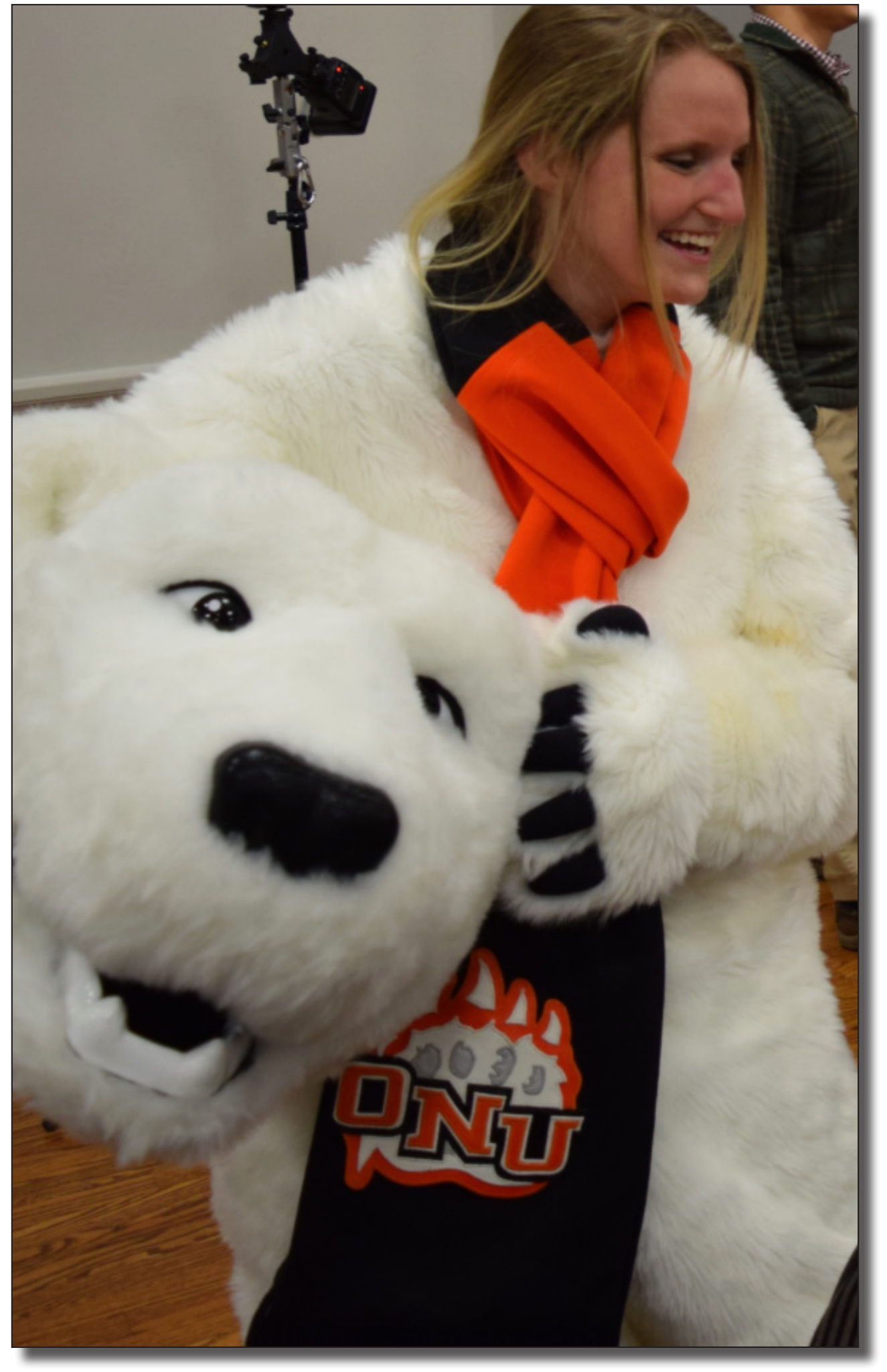
At a charity event