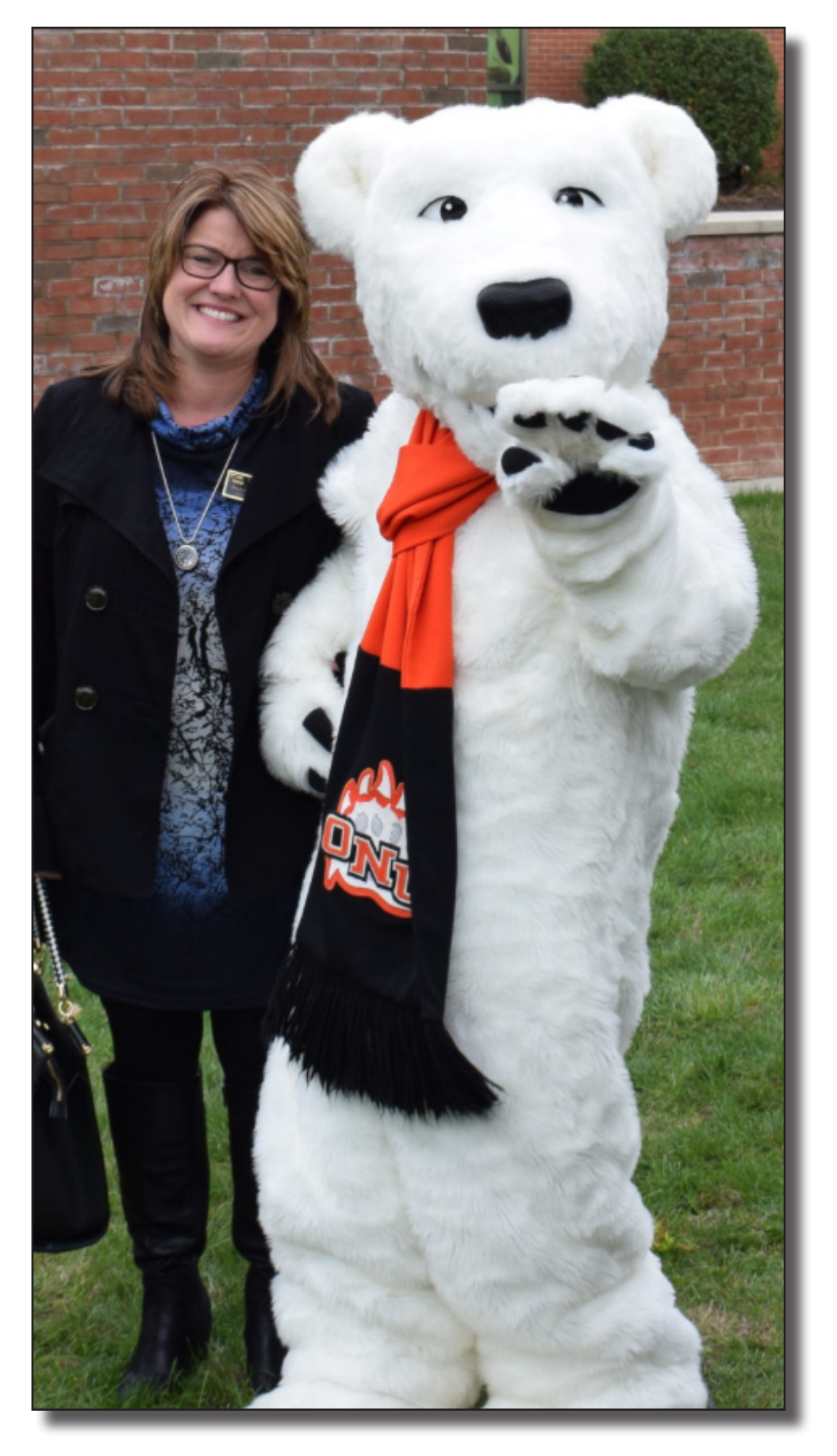
At a groundbreaking