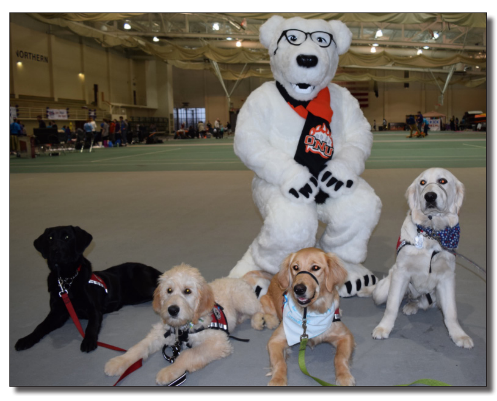
With many friends